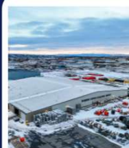
206 PLAINVIEW INDUSTRIAL 80,000 SF WAREHOUSE