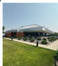
2675 KING AVE W RETAIL FORMER BANK