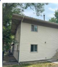
707 N 31ST MULTI-FAMILY 12-PLEX