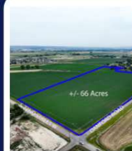
6807 DANFORD LAND 66 ACRE LAND DEVELOPMENT