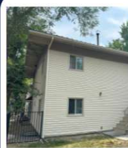
707 N 31ST MULTI-FAMILY 12-PLEX