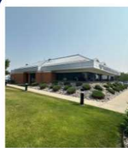
2675 KING AVE W RETAIL FORMER BANK