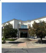
2075 OVERLAND OFFICE 10,000 SF OFFICE BUILDING