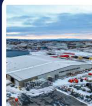
206 PLAINVIEW INDUSTRIAL 80,000 SF WAREHOUSE