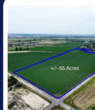
6807 DANFORD LAND +/- 66 Acres 66 ACRE LAND DEVELOPMENT