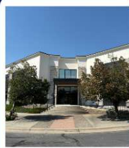
2075 OVERLAND OFFICE 10,000 SF OFFICE BUILDING