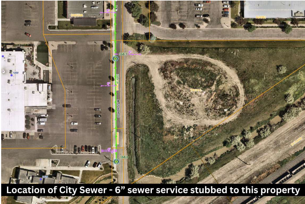
Location of City Sewer - 6" sewer service stubbed to this property

GABLE RD & S 24TH ST W Gable Rd & S 24th St W Billings, MT 59102