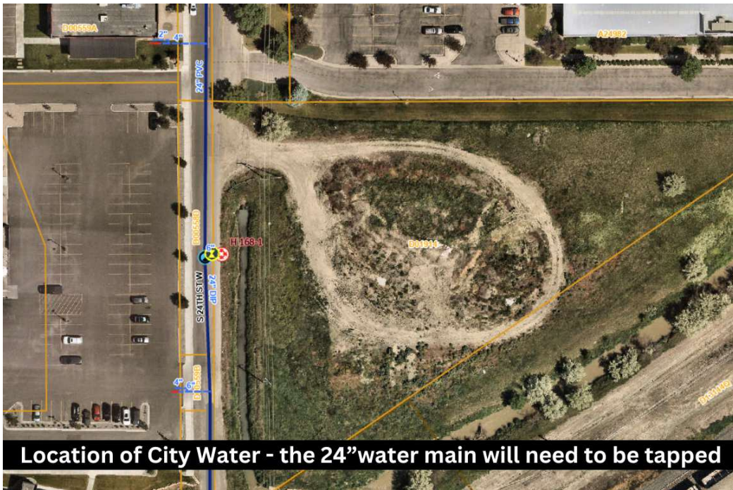
Location of City Water - the 24" water main will need to be tapped