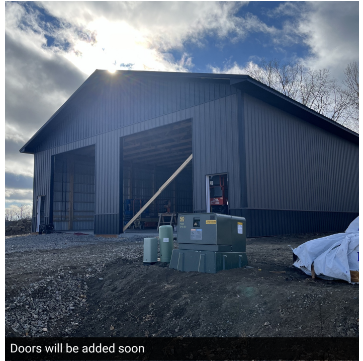
Doors will be added soon