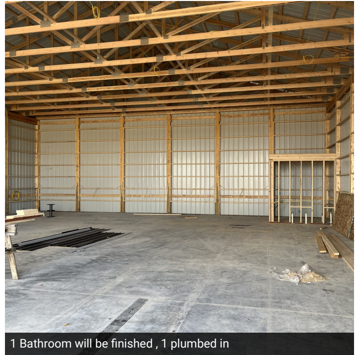
1 Bathroom will be finished , 1 plumbed in

Shaylee Green CCIM 406 208 7723 shaylee@cbcmontana.com