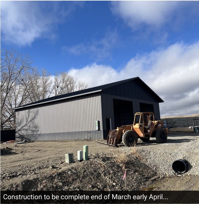
Construction to be complete end of March early April...