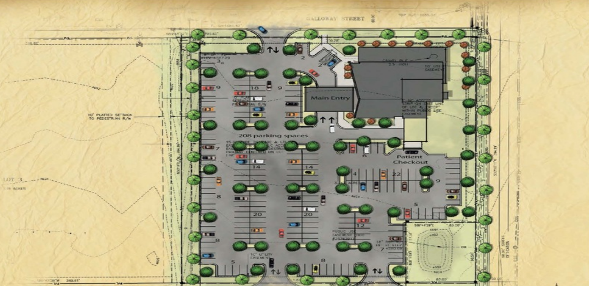
BIG406LLC Medical Office