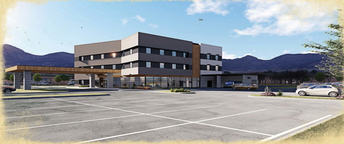
BIG406LLC Medical Office Base Building Render