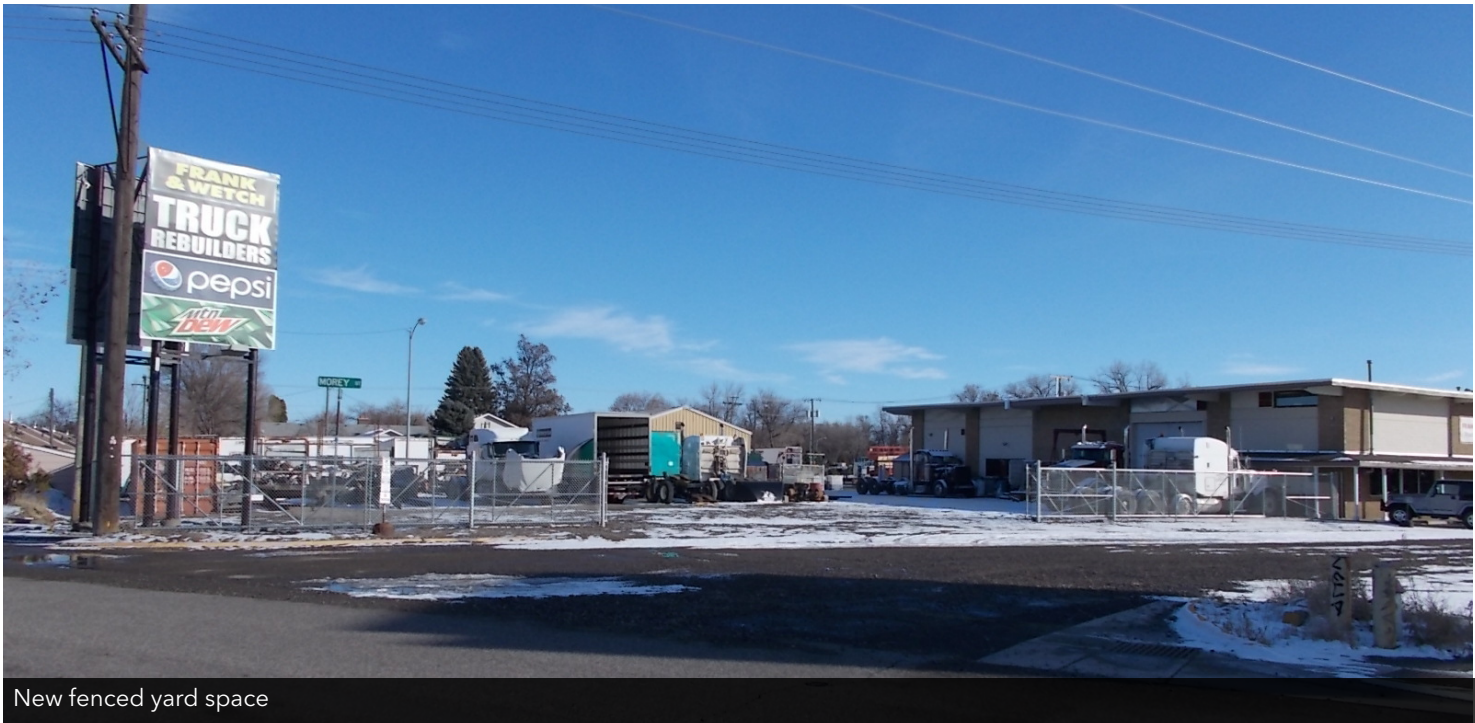
New fenced yard space