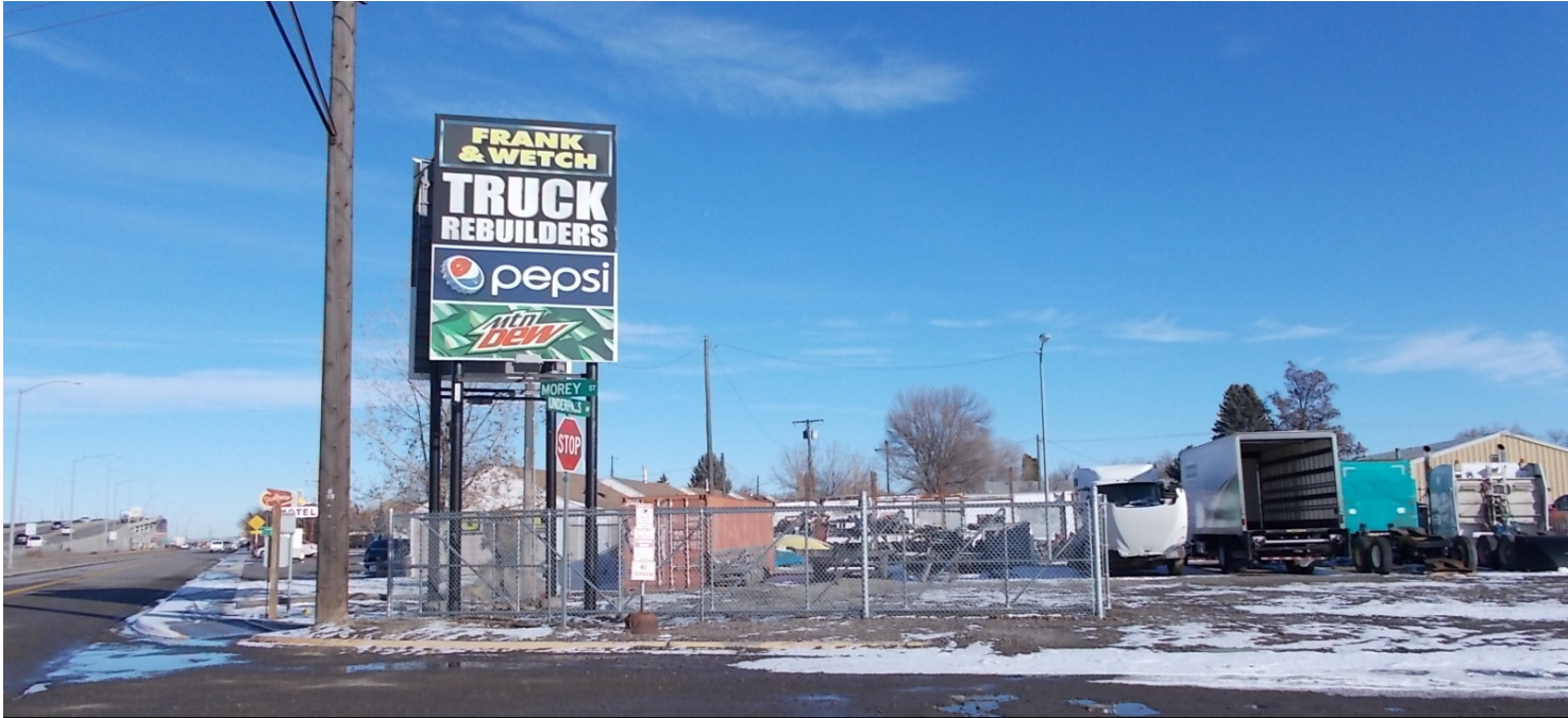
New fenced yard space