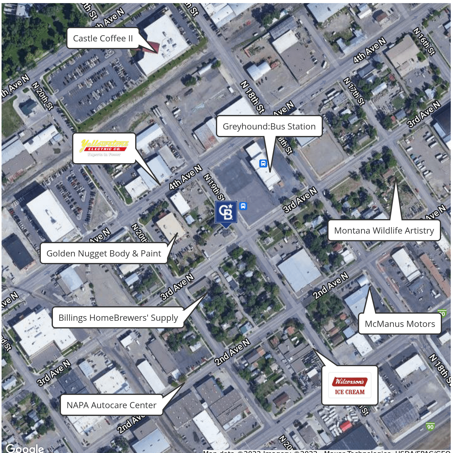
Map data ©2022 Imagery ©2022 , Maxar Technologies, USDA/FPAC/GEO

304 North 19th Street 59101, MT Billings