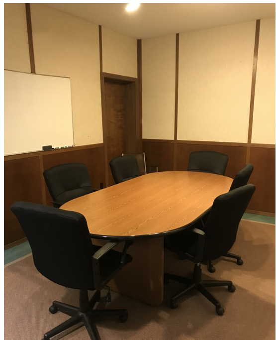
Common area conference room