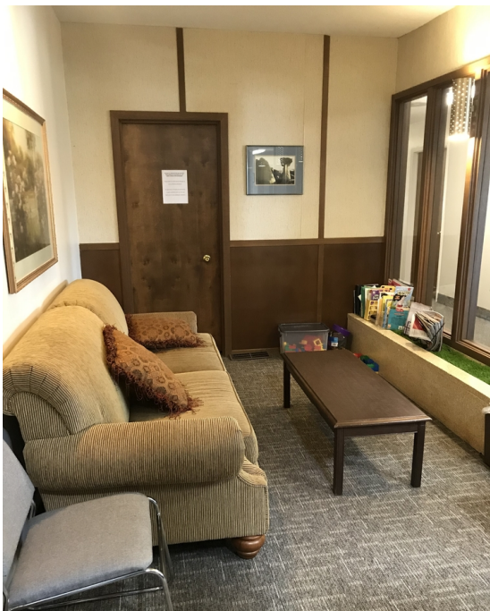
Common area reception