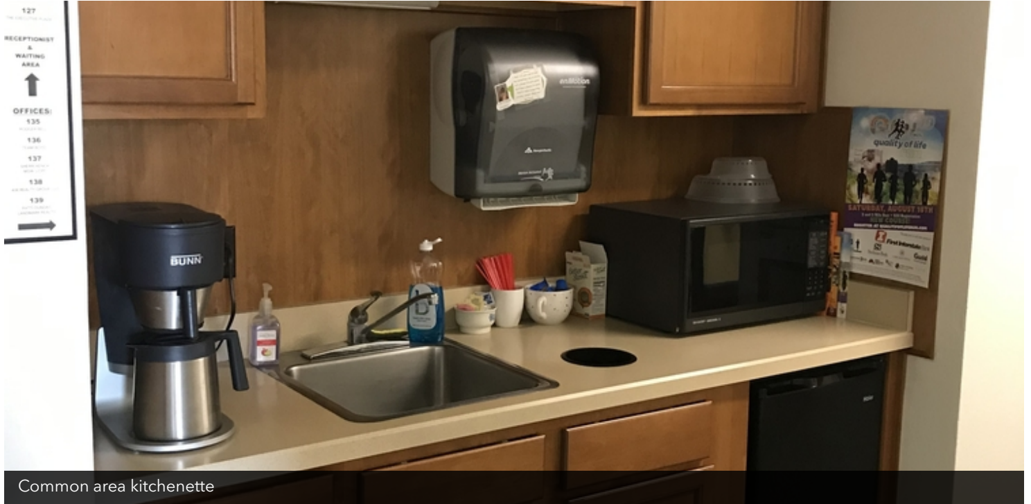
Common area kitchenette