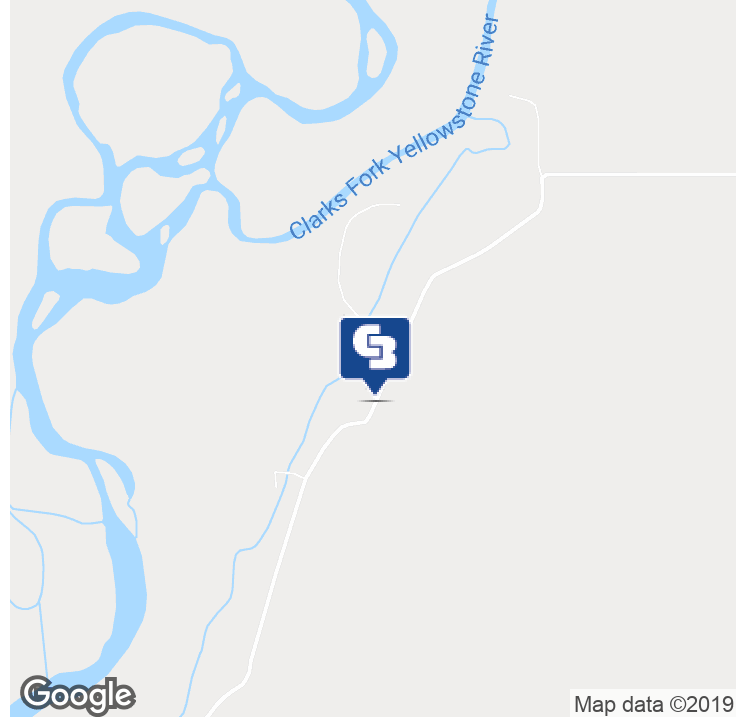
Map data ©2019